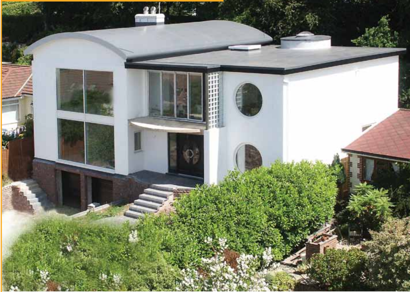
Case study - Focus on 'Aesthetics'

This Grade II listed building is located in a West Sussex conservation area. The homeowner was very aware of the potential theft risk to the new roof that installing traditional lead would create. Through discussion with the planning and conservation agencies, approval was granted for a Sarnafil roof in lead grey with matching batten roll profiles to be installed to ensure the traditional features of the property were maintained. Additionally, the extravagant costs associated with lead materials, and the difficulty to find trained and qualified installers made the choice simple. Roof Assured by Sarnafil fulfilled the criteria, giving the homeowner a substitute which offers greater value for money, that met Planning Authority consent for this project, and most importantly was supplied and installed by approved, trained and qualified, Registered Installers.