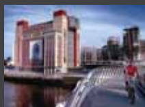
Baltic Centre, Gateshead