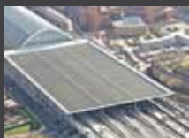
St Pancras, London