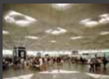
Passenger Terminal, Stansted Airport