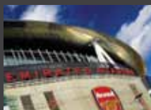
Emirates Stadium, London