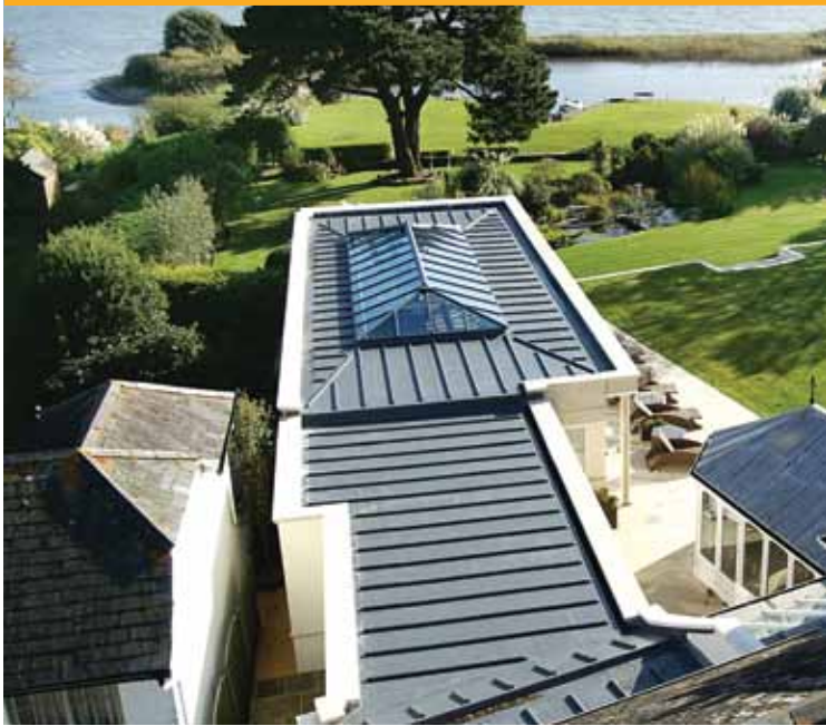
Case study - Focus on 'Guarantees'

“We understand that a roof can define the look of your home...”