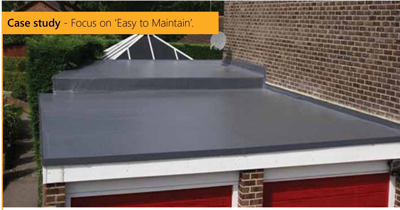
Case study - Focus on 'Easy to Maintain'.

“Sarnafil offered a system that would take very little upkeep through the duration of its life...”