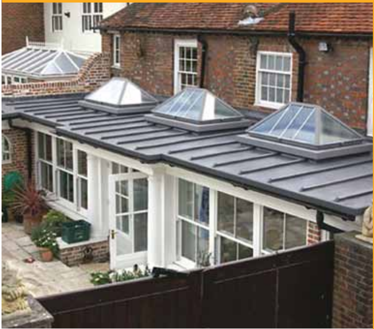
Case study - Focus on 'Trusted Installers'

Being situated in close proximity to the seaside, it was essential that this homeowner secured a lengthy guarantee on their roofing system. Sarnafil was the perfect choice. A “unique to that property” specification was prepared including wind uplift calculations. This provided confidence for the client that a Sarnafil product has the durability and flexibility to contend with the strong winds and fluctuating temperatures of the Bournemouth coast, along with a 15 year product guarantee and the peace of mind that Sarnafil has a life expectancy exceeding 40 years*.