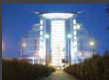
St David's Hotel, Cardiff Bay